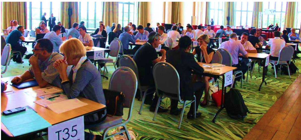
B2B meetings at the GeoEnergy Days, July 4, 2018 in Pau, southwestern France

The B2B meetings organized in the mark of POLE AVENIA's GeoEnergy Days were very well received by the GEO-ENERGY EUROPE partners, some cumulating up to 18 interviews over the 2 days of the event, all emphasizing the number and quality of the contacts made, of which a few to be followed up shortly for near term action.