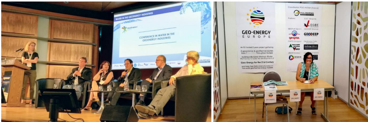
GeoEnergy Days 2018. Left : Panel discussion on Lithium recovery as a by-product of deep geothermal projects. Right : GEO-ENERGY EUROPE inaugurates 1st booth at a geo-energy event.

Hosting partner and project coordinator POLE AVENIA took advantage of the project meeting on July 5 to showcase 2 research institutions & facilities and 6 among its most dynamic SMEs that are active in the deep geothermal industry, with a particular focus on geothermal drilling, including 2 fast growing startups created in 2015 and hosted in the geoscience startups incubator, Geostart, where POLE AVENIA also has its premises.